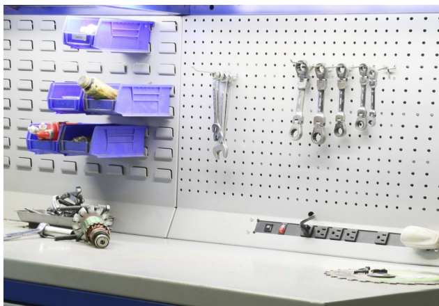
Louvered, plain or perforated back panels