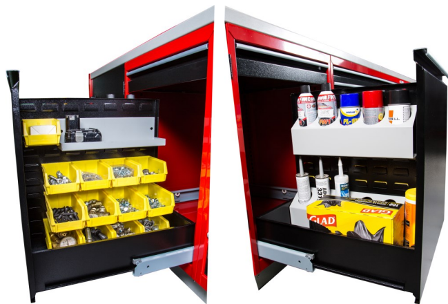
Louvered panel drawers