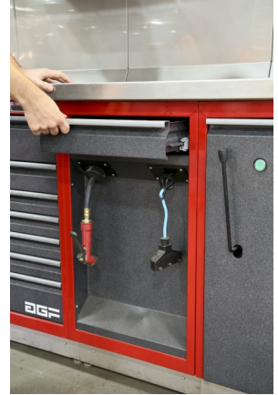
Air and fluid roller reels