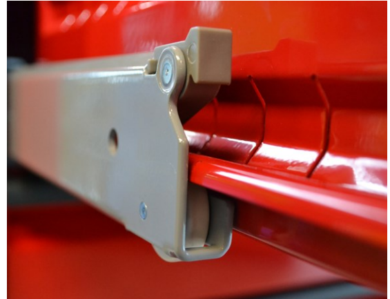
27 Series - load capacity of 200 or 440 lb