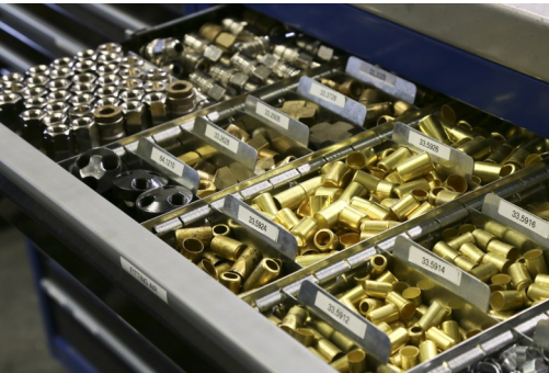
Wide range of dividers and partitions